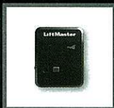
Remote Light Control (Model 825LM)

The Chamberlain Group, Inc. 845 Larch Avenue Elmhurst, IL 60126 www.LiftMaster.com