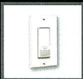
Remote Light Switch (Model 823LM)