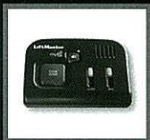
Garage and Gate Monitor (Model 829LM)

For additional MyQ® enabled accessories, ask your authorized LiftMaster® dealer, or visit www.LiftMaster.com